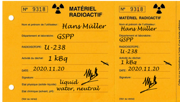
Figure 5 Yellow leaflet with unique ID. Information required are : name, unit, isotope, activity in Bq (if possible), date, form (solid/liquid), pH (if known).

with uranium salts may dispose of up to 1 kBq per week as regular wastes. This value is the cumulative total of the activities of all waste items produced. However, it is strongly recommended to organize waste management in such a way as to remain significantly below this threshold.