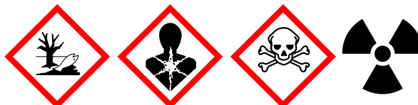
Figure 1 The three GHS hazard pictograms and the symbol for ionizing radiation required on any container of uranyl salts in powder form.

Due to the presence of the heavy uranium ion (mainly 99.9% of U-238), these salts expose humans as well as the environment to chemical and radioactive hazards (see Figure 1 and Figure 2).