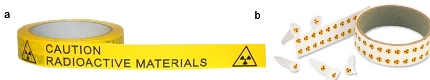
Figure 9 Radioactive warning tape. (a) With text and (b) with only the radioactive symbol.

Any material and equipment used for uranyl related activities needs to be labelled with a radioactive material warning tape (Figure 9a) or, for small objects or vials, with an ionizing radiation warning symbol (Figure 9b). This equipment must not be used for other activities. If necessary, only after a verification by a radiation protection expert the equipment can be reassigned to other tasks.