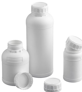
Figure 7 Wide mouth fluorinated chemical bottles for liquid waste. Three different sizes available: 250 ml, 500 ml and 1000 ml (HDPE).

Once retrieved by the FRPO, the waste is stored in the radioactivity waste facility of each Faculty. Each year, the total uranium-related waste is sent to a treatment facility, typically the Paul Scherer Institute (PSI); depending the amount of waste, the cost of this procedure can be transferred to each unit.