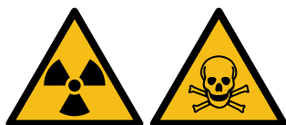
Figure 4 Ionizing radiation and toxic materials hazard symbols, ISO 7010.

Stock solutions have to be stored in retention trays inside fridges or ventilated cupboards. Below 100 \mu l volume, only the container and the container holder need to have the radioactive warning symbol. Above this limit, both radioactive and toxic warning symbols must be applied on the door of the ventilated cabinet as well (see Figure 4).