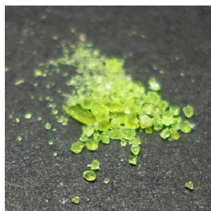
Figure 3 Uranyl acetate crystals.

Uranyl acetate is extensively used as a negative stain in electron microscopy, mostly related to biological samples due to their low content in metal ions. It is highly water soluble and once prepared in stock solution, it has a shelf life of more than a month when stored in a fridge.