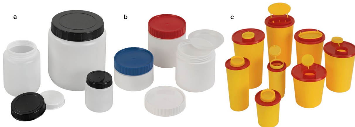
Figure 6 Boxes for storing the dry waste of uranyl acetate activities. (a) Polyethylene (HDPE) black cap; (b) Polyethylene (HDPE) colored cap with extra lid ; (c) Quick-Box® Waste-boxes for sharps, Polypropylene (PP).

The waste storage container size needs to be chosen according to the amount of waste generated. Liquid and solid waste must be stored in separate container. It is advised to separate as much as possible contaminated from non-contaminated waste. The smallest containers adapted to the expected waste production should be used. Wide-mouth HDPE and PP boxes are recommended for dry waste. Small-opening containers have to be used for liquid waste as they ensure a lower risk of spill. Examples of containers available in EPFL shops are shown in Figure 6 and Figure 7.