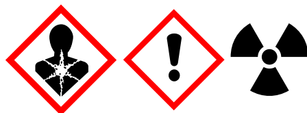
Figure 2 The two GHS hazard pictograms and the symbol for ionizing radiation required on a container of 2% uranyl stock solutions.

Once diluted in water or other solvents, the following chemicals are usually referred as “uranyl staining solutions” or “stock solutions”. Their dilution limits their acute toxicity but the chronic toxicity and radioactivity hazards remain.