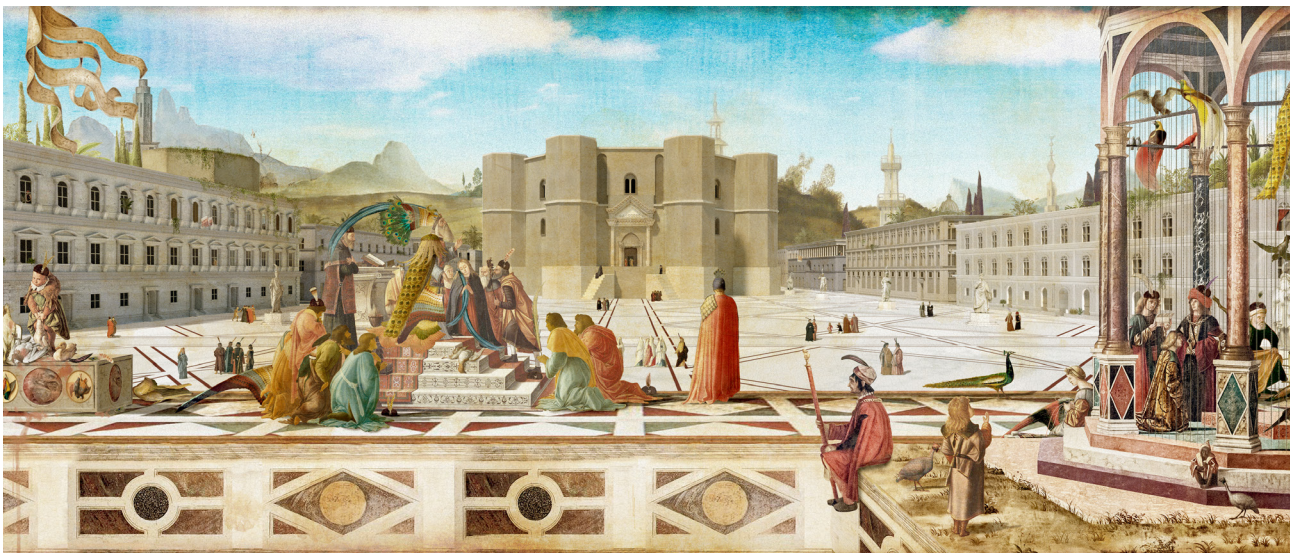
Allégorie des plumes or La vêtue de Son éminence le douzième prélat d'Amauroto, Render, work sample, FF, 2018