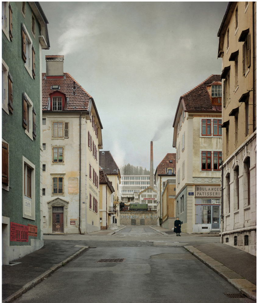
NB, La Chaux-de-Fond, Collage Perspective, 2022

LAPIS' primary objective is to advance digital practices in architectural representation while sustaining a continuous dialogue with the figurative tradition, both in the pictorial pursuit of truth and architectural drawing in its speculative and timeless dimension. A major contribution to this field is the development of a specific operational method for both analysis of artworks and teaching of representational techniques oriented towards the discipline. A central endeavour is the investigation of the theoretical and practical implications of Digital Transition, with a particular emphasis on training present and future architects in specialised fields such as image analysis, synthesis, and processing. Our ambition is to contribute to the discourse on the methodology of representation by redefining the visualisation process exploring the inner dialogue between analogue and digital tools.